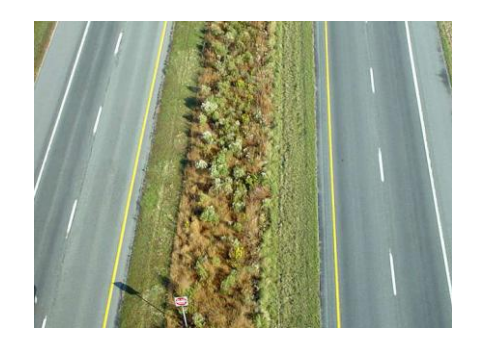
Helping the Environment Starts in Your Own Yard – Promote Environmentally Friendly Landscaping. Traditional landscaping often has harmful environmental impacts. Clearing natural habitats for urban/suburban growth and planting vast lawns place a heavy toll on the environment. This type of landscape requires