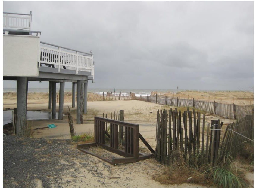
10-30-2012 About 8:30 AM EDT