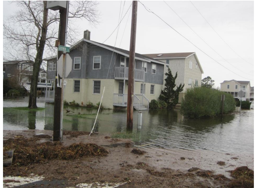
10-30-2012 About 8:30 AM EDT