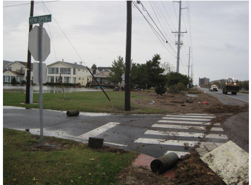
10-30-2012 About 8:30 AM EDT