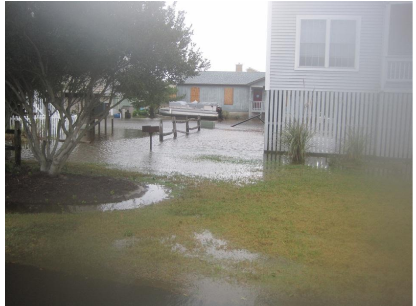
10-30-2012 About 8:30 AM EDT