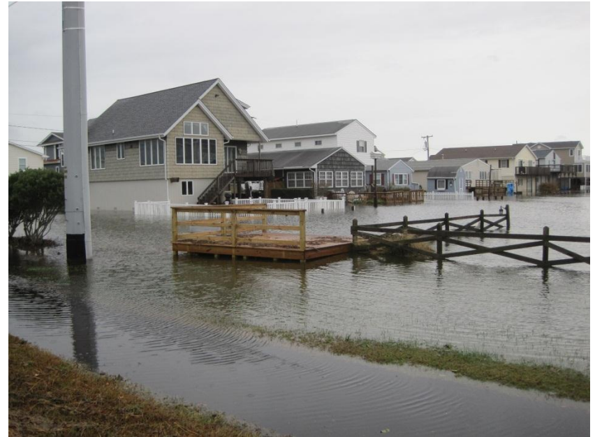
10-30-2012 About 8:30 AM EDT