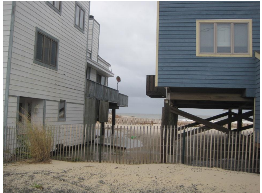
10-30-2012 About 8:30 AM EDT