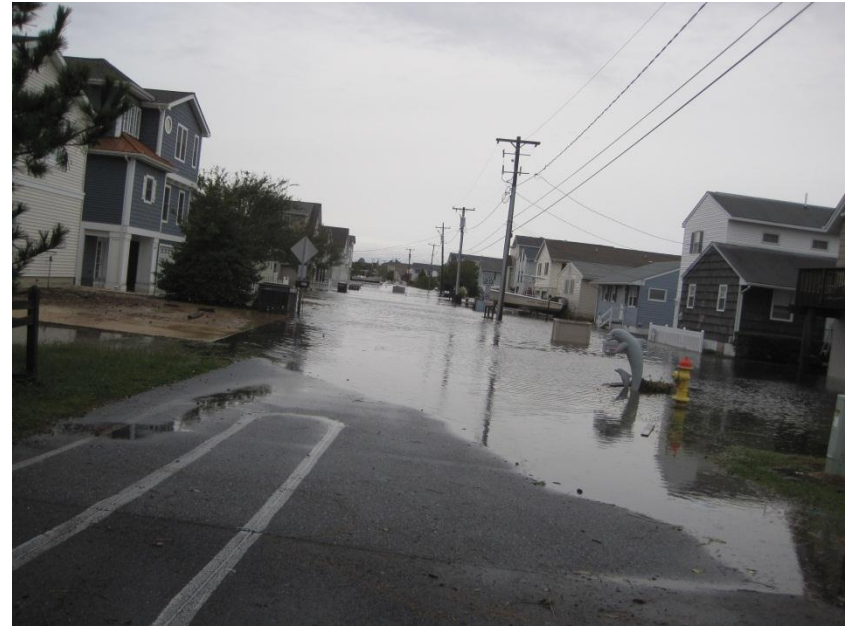
10-30-2012 About 8:30 AM EDT