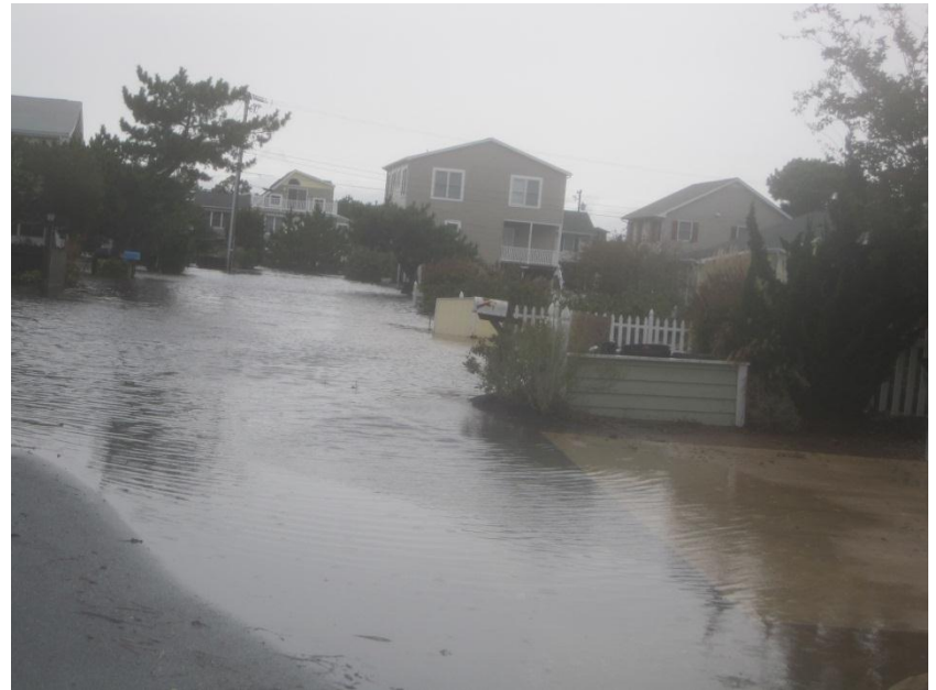
10-30-2012 About 8:30 AM EDT