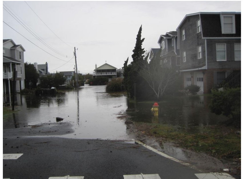
10-30-2012 About 8:30 AM EDT