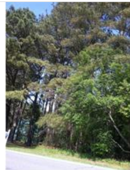
looking north east