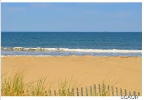
Nearby Ocean Beach