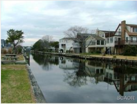
Canal front views