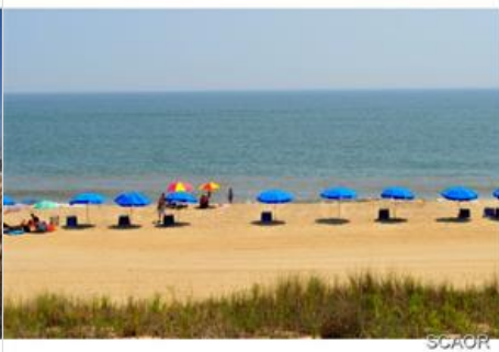
Nearby Ocean Beach