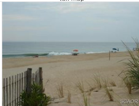
close to the beach