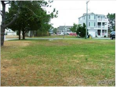
Build your beach home here!