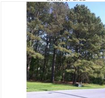
looking south east