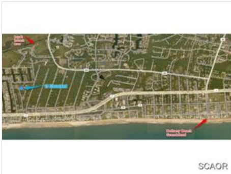
aerial of area