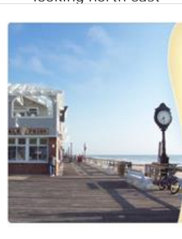
close to the boardwalk