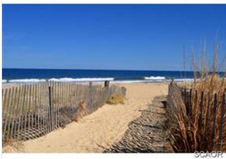
Nearby Ocean Beach