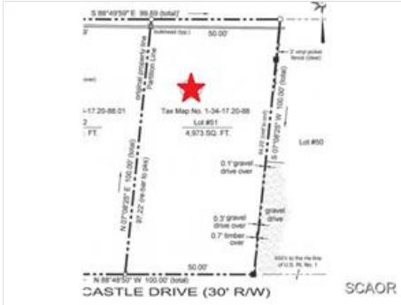
Lot 51 New Castle Drive