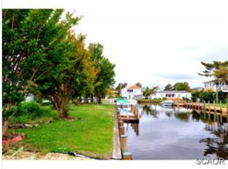
Canal Side of Lot