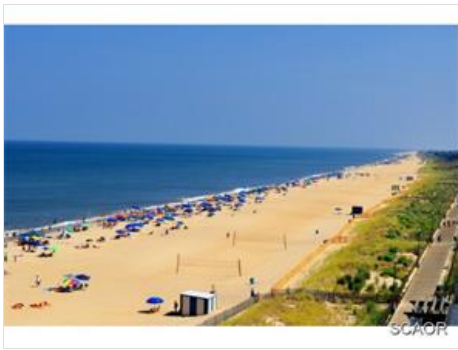
Nearby Ocean Beach