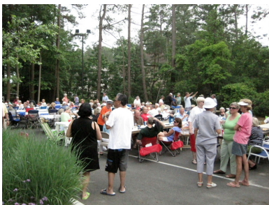
Over 240 attended