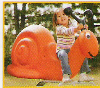
Pokey the Snail #963 • $595 • one-seat rider