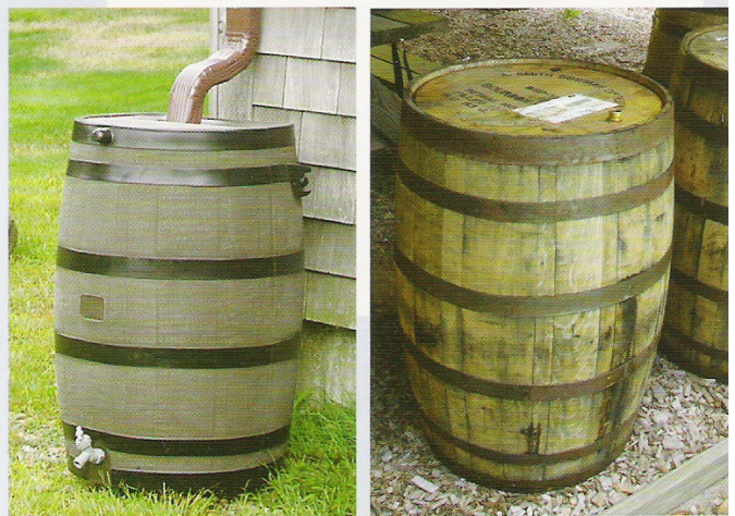
Rainbarrels are available in various sizes and are made of plastic or from wood barrels. A plastic rainbarrel in 30-60 gallon capacity with downspout kit cost about $100-$250 range. Wooden rainbarrels are $200-300. Or, you can make one yourself. Directions are available online.

Are mosquitoes a problem? Nope, the rainbarrels should be covered so Delaware's air force can't lay eggs. Do rainbarrels work if a homeowner is away? You bet—installing a soaker hose on the open spigot will allow the slow release of the captured first flush onto any permeable surface.