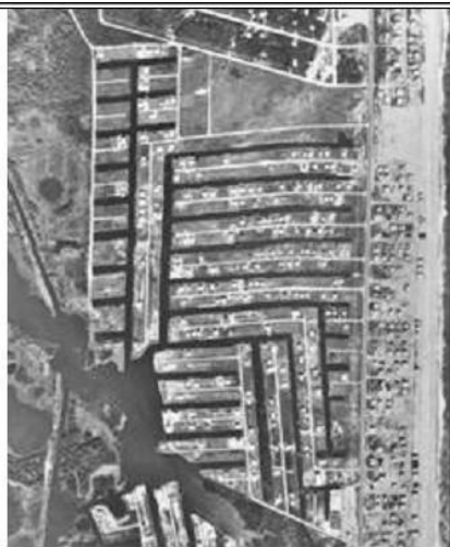
Aerial View - October 10, 1970