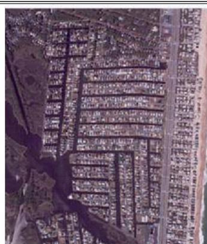
Aerial View - Circa 2005